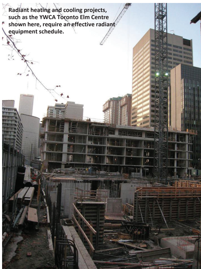
Radiant heating and cooling projects, such as the YWCA Toronto Elm Centre shown here, require an effective radiant equipment schedule.

An effective equipment schedule provides: 1) the total flow rate required to each manifold, as well as the head loss it will induce, as reference for the engineer sizing the distribution system for the radiant manifolds 2) a fairly accurate idea of how many manifolds and how much PEX pipe will be needed to serve zones as reference for the contractor, and 3) the total radiant system capacity under design conditions, allowing the engineers specifying the air side of the HVAC system to appropriately size components to complement radiant capacity for an optimized hybrid radiant-forced air system design.