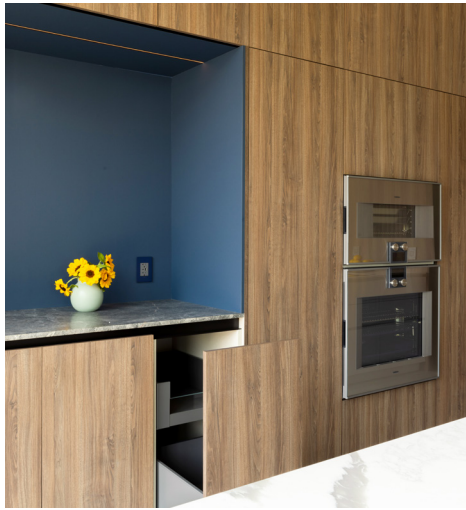
"We like RAUVISIO terra for its texture, 3D lamination and the way it feels and functions," explained Erck. "It's super durable in high-traffic environments like the kitchen. Its fingerprint resistance and soft touch feel are great features as well, which are also features we like about RAUVISIO noir."

RAUVISIO noir Maltese Mist was chosen for the main island, lending a bright feel to the kitchen with its crisp white hue. The second island adds another layer of color with the neutral, elegant RAUVISIO noir Trench Coat. This shade was also used for the taller cabinets branching off from the second island, offering ample storage.